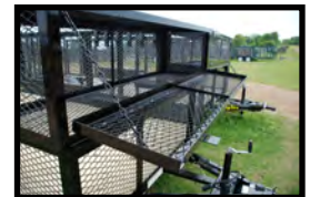
Removable /Lockable Landscape Box