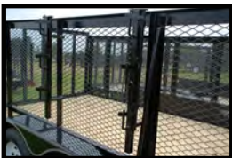
Weed Eater Racks