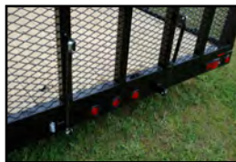
Gas Spring Assist on Ramp Gate